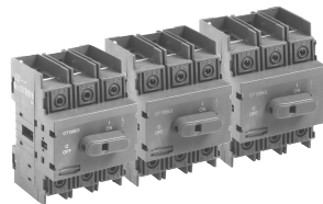
CDNF30 CDF60 CDF100