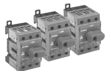
CDNF16 CDF25 CDF32