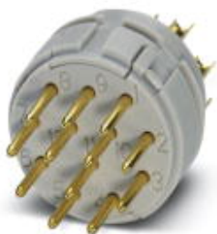
Contact insert, number of positions: 12, type of contact: Pin, Solder connection

Please be informed that the data shown in this PDF Document is generated from our Online Catalog. Please find the complete data in the user's documentation. Our General Terms of Use for Downloads are valid ( http://phoenixcontact.com/download )